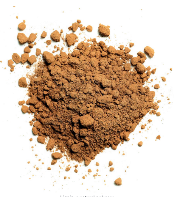
Lignin, a natural polymer

Arpa always takes actions that provide a "win" for the environment and for clients too. The Bloom technology allows to maintain the quality and wellknown features of FENIX NTM® and Arpa®, while supporting our clients in realising their sustainability challenges. It means that Bloom provides a higher value to our clients' projects and products with no implications in term of quality and performance.